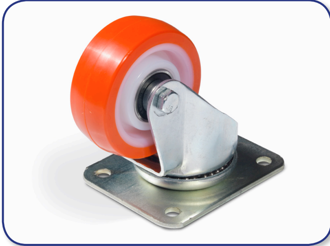
Old Red Castor.

The new castor is more robust in design and has an extended life due to the heavy duty construction when compared to the old version.